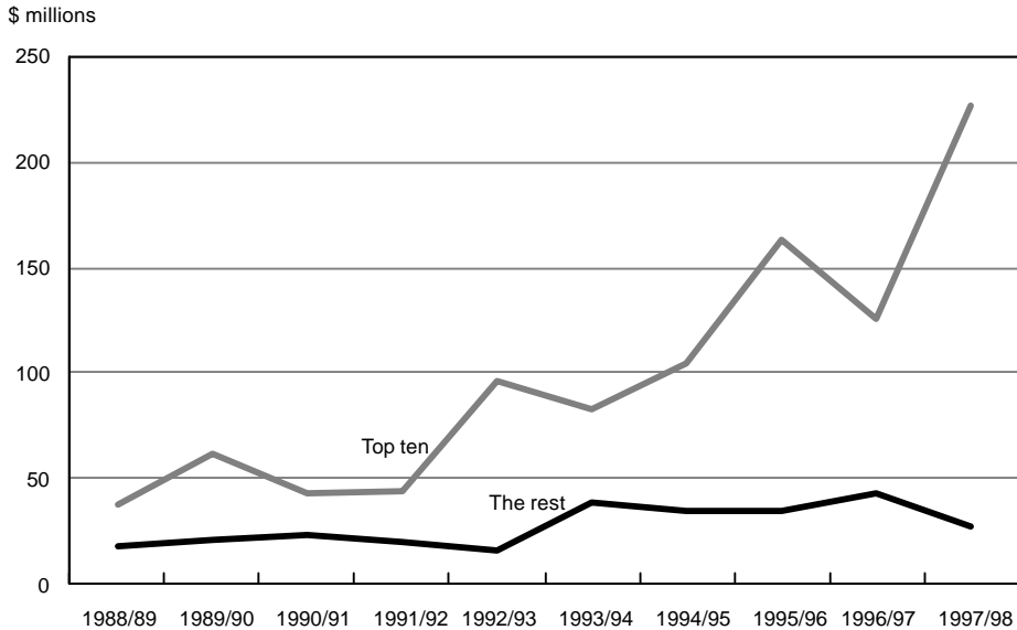
Chart 2. Television Production Exports, 1988-89 to 1997-98

growth in production revenues has come from sales abroad. In 1988-89 exports accounted for only 15% of production revenues, or $80.5 million. By 1997-98, they had shot up to 38% of production revenues, or $423.5 million. It is the sale of television programs that lie behind this growth in exports. Almost 60% of the export growth is the result of sales of television programs.