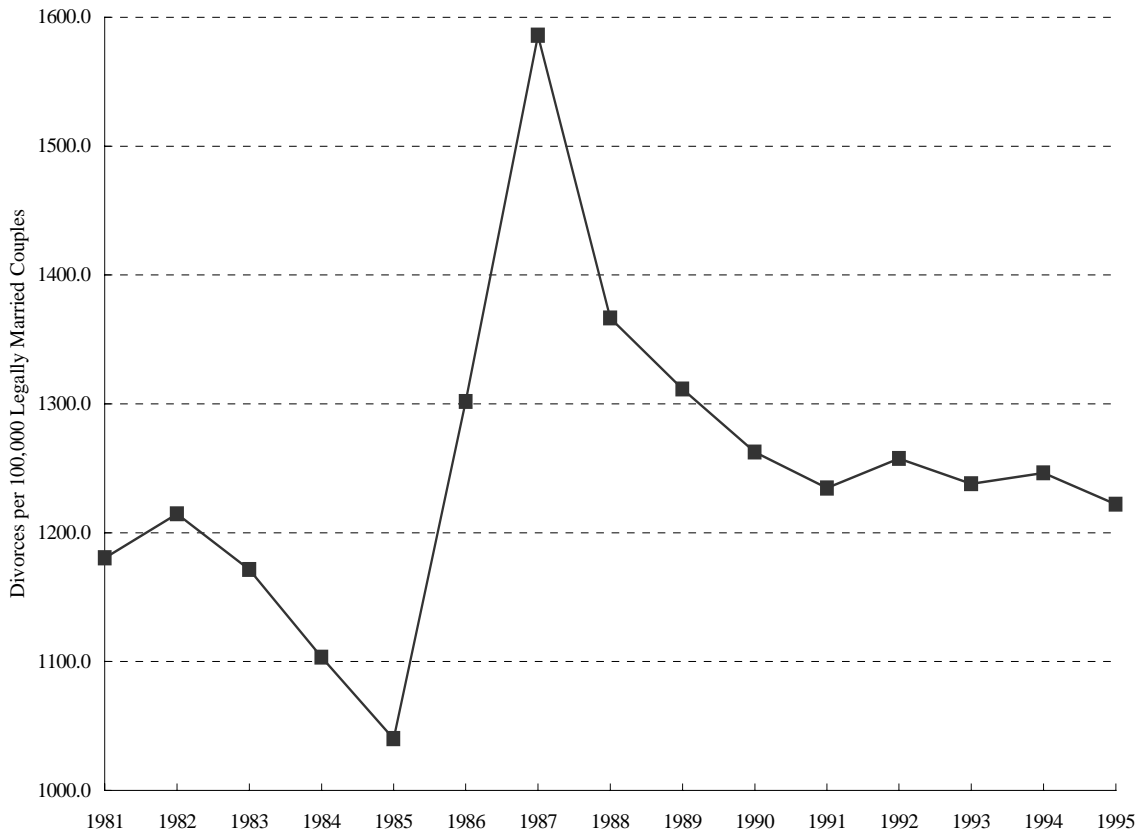
Figure 1 DIVORCE RATE IN CANADA: 1981 TO 1995 (Rate per 100,000 Legally Married Couples)